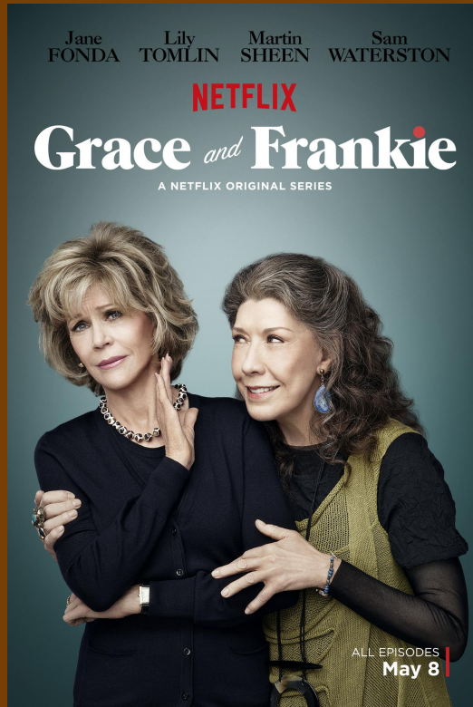
"GRACE AND FRANKIE" (2015-2022) BY MARTA KAUFFMAN & HOWARD J. MORRIS