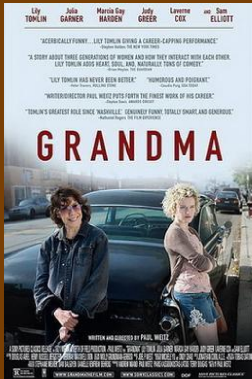
"GRANDMA" (2015) BY PAUL WEITZ