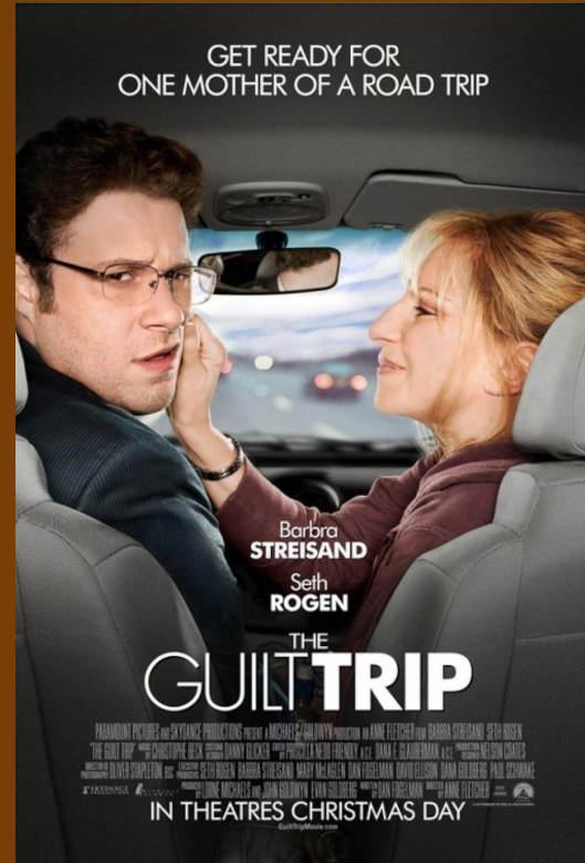
"GUILT TRIP" (2012) BY ANNE FLETCHER